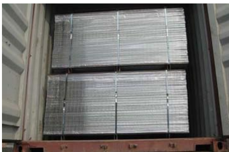
Welded wire fence panels are packed in a container.

Packed in woven bags or waterproof paper. Packed in wooden pallets for shipping.