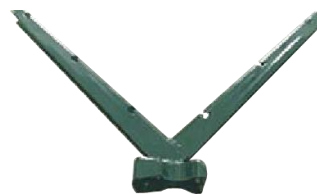
Double arm extension

Round & square clamp: It is used to fix the wire fence to the post and connect the neighbor panels with bolts and nuts.