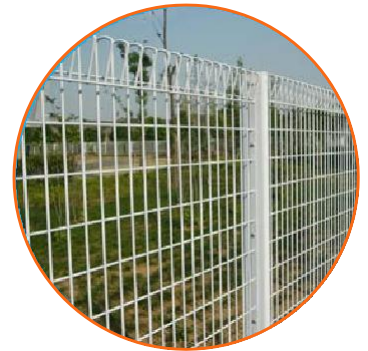
Welded wire fence protects grass and trees.