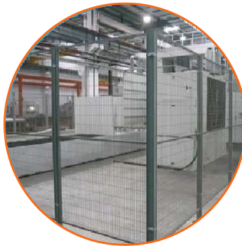
Welded wire fence in a workshop used to protect machines.