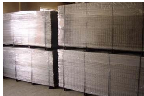
Many welded wire fence panels are stored in a warehouse.