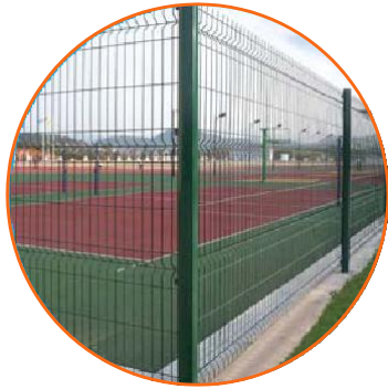
3D security fence for sport field.