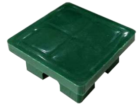
Round fence post cap Square fence post cap

Round & square fence post cap: It can be installed on the top of the post so as to avoid something or rain and snow to drop into the post and corrode the inner surface.