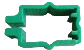
Round clamp Square clamp

Round & square clamp: It is used to fix the wire fence to the post and connect the neighbor panels with bolts and nuts.