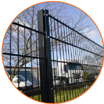
Double wire fence is installed at the side of the road.