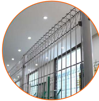
Roll top fence in the room for decoration.