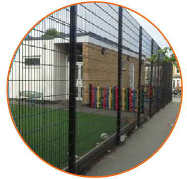
Dense wish welded wire fence is anti-climbing.